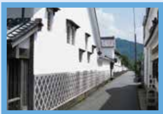
萩 Hagi Castle town (World Heritage)