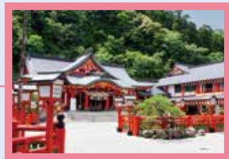
津和野 Tsuwano Old town