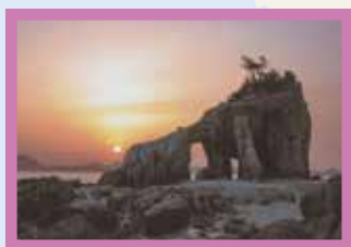
山陽小野田 Sanyo-Onoda Motoyama Cape