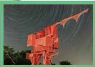
宇部 Ube Tokiwa Park