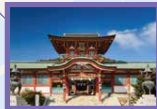
防府 Hofu Hofu Tenmangu shrine