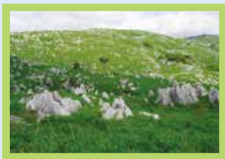
美祢 Mine Akiyoshidai Plateau