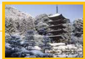
山口 Yamaguchi Rurikoji temple's five-storied pagoda (national treasure)