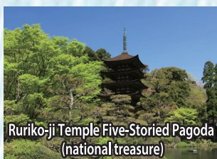
Ruriko-ji Temple Five-Storeyed Pagoda (national treasure)