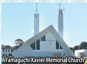
Yamaguchi Xavier Memorial Church

In the case of one or two people, a taxi (compact or medium-sized) is used, and in the case of three or more people, a jumbo (van-type) taxi is used.