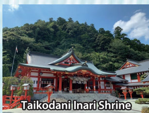
Taikodani Inari Shrine