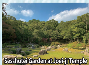
Sesshutei Garden at Joze-ji Temple